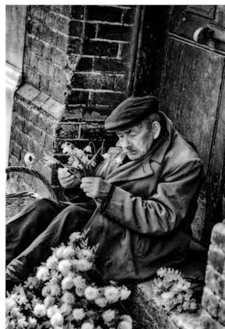
Flower seller 1959