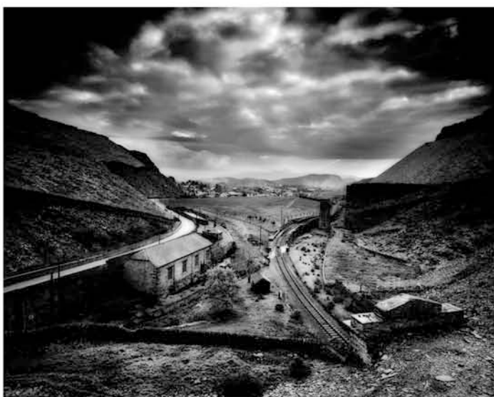
Slate mine, Wales 1985