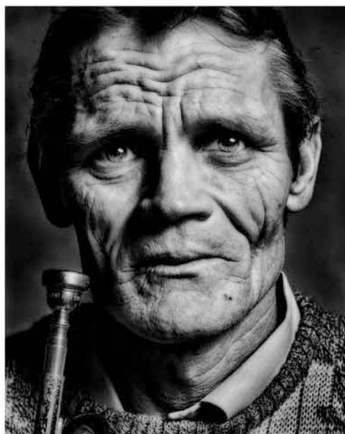
Chet Baker 1986