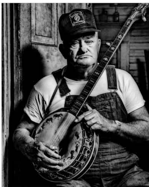
Banjo player, Tennessee 1986