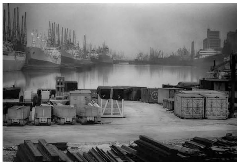
Docks, London 1964